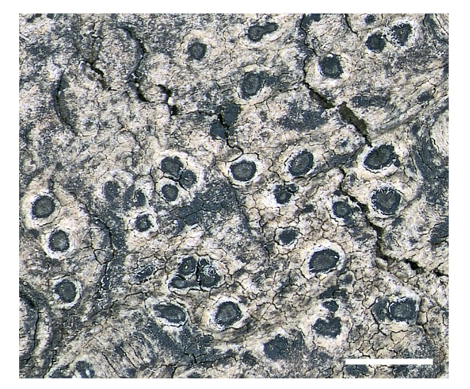
Figure 1. Mazosia corticola habit (holotype). Scale = 1 mm.

Distribution and ecology . Mazosia corticola is known from four widely separated localities, three in Tasmania (all from different bioregions of the island) and one from Victoria. All are from the bark of the subdominant, cool temperate rainforest tree, Atherosperma moschatum , a tree with a persistently smooth, aromatic bark. Within rainforest vegetation, Atherosperma is known for supporting